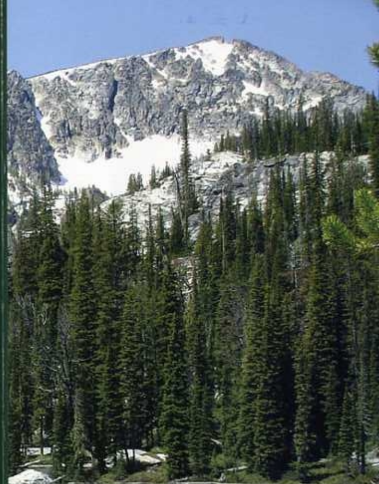
Trapper Peak Mountain overlooking Baker Lake a short 16 mile drive from Creekside