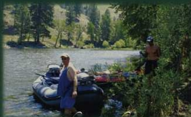
Fishing on the Bitterroot

Big Sky territory is the recipe for rest and relaxation. You may choose to spend a quiet day around the cabin, relaxing in a hammock under a willow tree while listening to the playful tunes of McCoy Creek. A walk across the pasture to sneak a peek at the herd of Buffalo and their calves or listening to the calls of wild turkeys is second only to watching the whitetail deer and their fawns in the spring. Of course there is no better fishing than in Montana. Our sparkling pond is stocked with trout or you can fly fish on the Bitterroot River with a little help from our outfitter friends in Darby. When the crisp Montana evening air is setting in, there is nothing better than gathering around the in-ground campfire or relaxing in the 6-person hot tub for a night of incredible star gazing. Regardless, if peace and quiet are on your agenda, we're confident that Creekside is the perfect place for you.